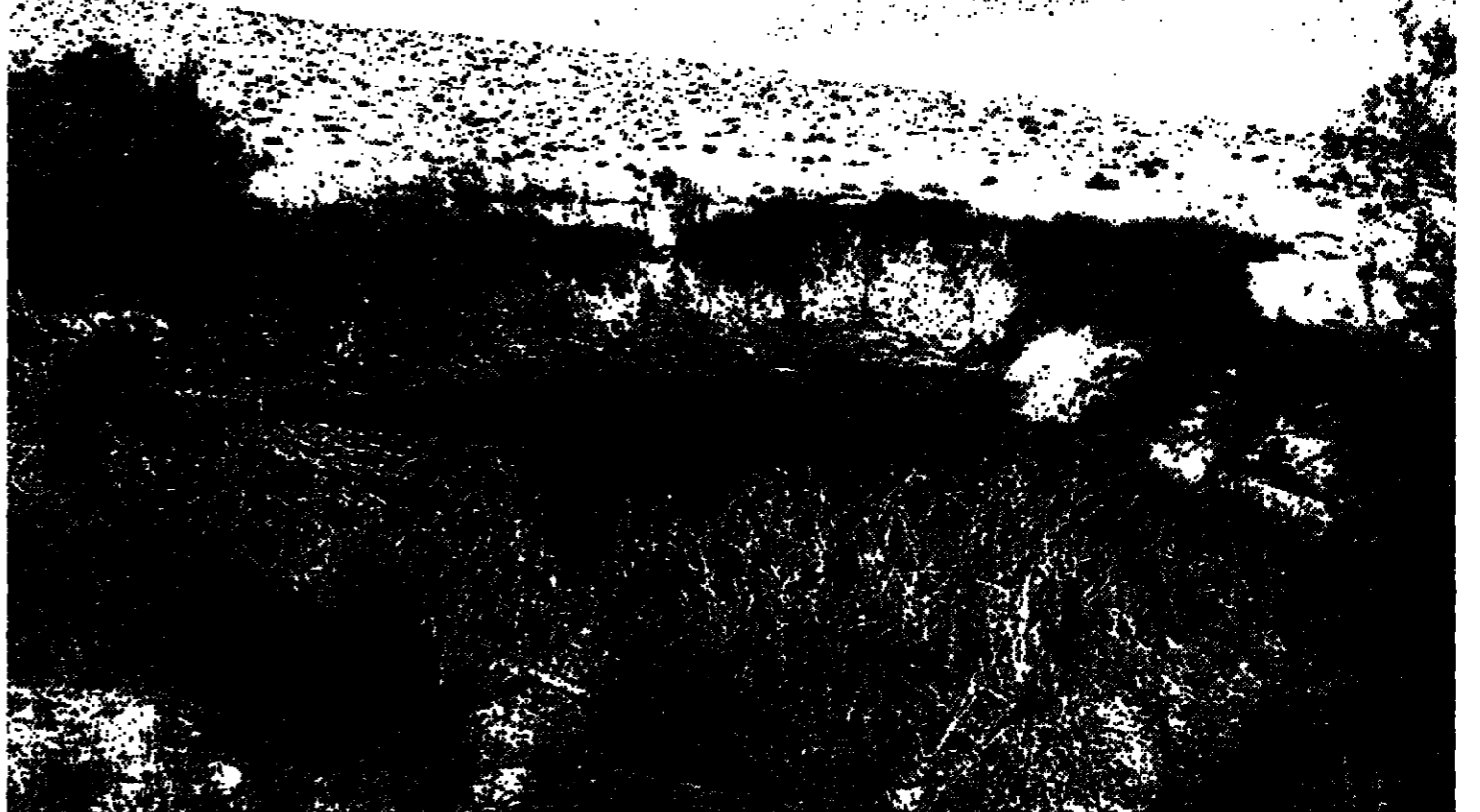
This cistern near Mitzpe Ramon is believed to have been built by King Solomon to settle and defend his southern border.